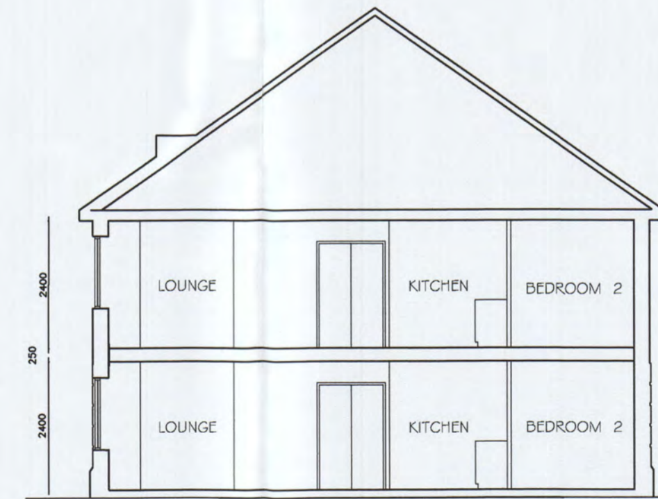
PROPOSED SECTION A - A